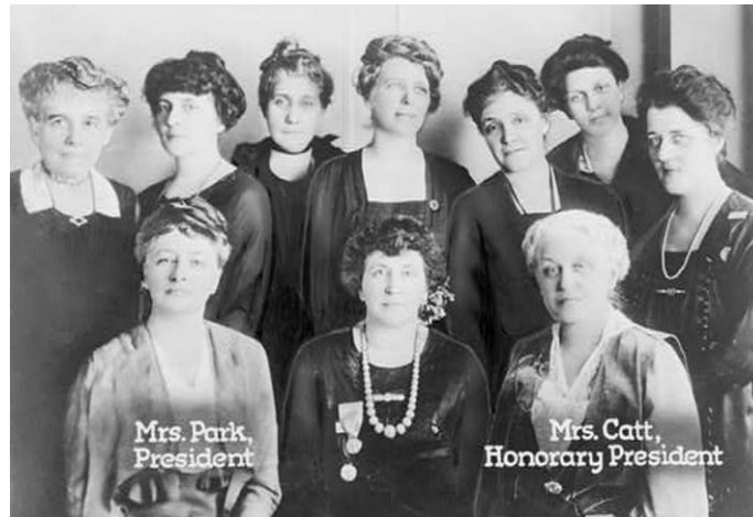
League of Women Voters National Board of Directors, Chicago Convention, February 1920

On February 14, 1920, roughly six months before the passage of the 19 th Amendment, Carrie Chapman Catt founded the League of Women Voters. Designed to help 20 million women carry out their new responsibilities as voters, Catt called the League "a mighty experiment." "...[N]o one could tell...in which direction its evolution would go," founder Carrie Catt remarked at the League's 1921 National Convention.