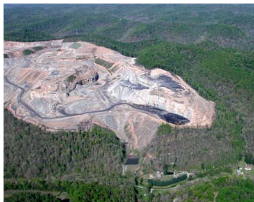
Figure 2. Mountaintop removal coal mine in southern West Virginia encroaching on a small community nearby.

Not to be overlooked in this discussion is the tremendous environmental damage caused by the mining of coal itself. Increasingly, in the Eastern United States, Appalachian coal is being mined by mountain top removal. This method requires that forests be clear-cut, the overburden of soil and rock loosened with high explosives, and the resulting debris pushed into nearby streams and valleys. 26 See Figure 2.