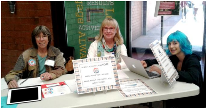
Delta High School