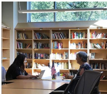
Vista Charter School