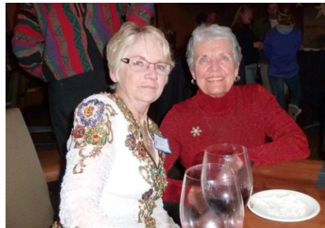
Leaguers and guests mixed well,