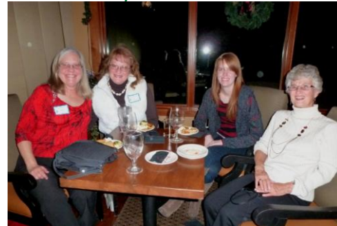
conversation flowed with young and old(er) alike,