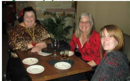
and a delightful time was had by all!