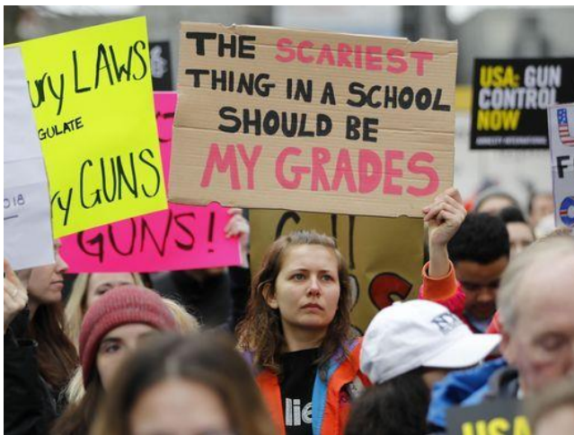
Tolga Akmen, AFP/Getty