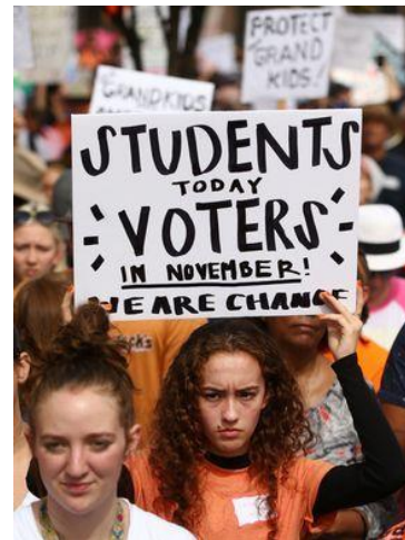
Students in Phoenix, AZ

On March 24, the date of #MarchforOurLives across the country, the League of Women Voters marched with students, parents and concerned Americans in Washington D.C., and other cities across our nation, to urge Congress to enact common-sense solutions to the gun violence plaguing our nation so that their lives and safety become a priority and hopefully to finally put an end to the epidemic of mass school shootings.